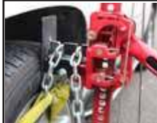
SAFE JACK SECURE LIFTER SLING