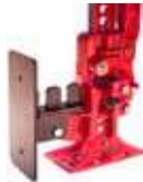
SAFE JACK SECURE LIFTER