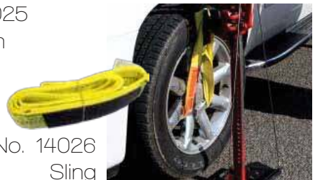
Part No. 14026 Sling

The warnings, precautions, and instructions discussed in this manual cannot cover all possible conditions and situations that may occur. The operator must understand that common sense and caution are factors, which cannot be built into this product, but must be supplied by the operator.