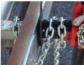
Part No. 14025 6 Foot Chain

SUITABLE FOR HI-LIFT JACKS TO USE IN CONJUNCTION WITH SECURE LIFTER