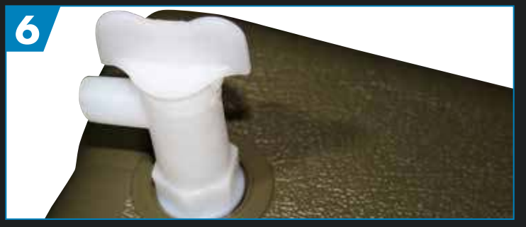
Fasten tap back into position on Can with tap now able to correctly tighten off in downward position.