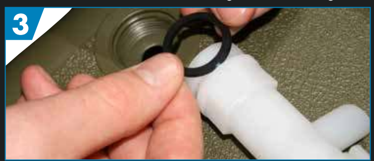
Position seal so that the outer edge with blue marker now sits against ridge facing away from tap thread.