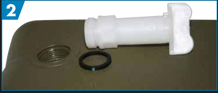
Remove the seal from the tap.