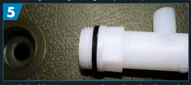
Seal should now taper towards tap thread, reducing the area of contact it makes with can thread when tightened.