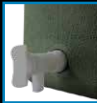
Free Tap Included