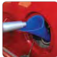
10701 Multi-Purpose Funnel™