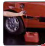
10800X/6 Super Siphon™