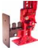
SAFE JACK SECURE LIFTER