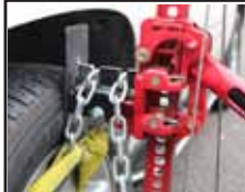
SAFE JACK SECURE LIFTER SLING