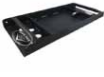
SAFE JACK UNIVERSAL BASE PLATE