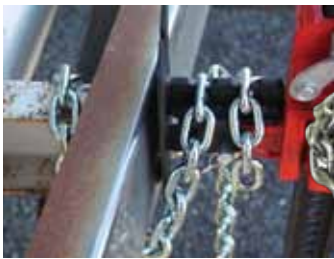
Part No. 14025 6 Foot Chain

SUITABLE FOR HI-LIFT JACKS TO USE IN CONJUNCTION WITH SECURE LIFTER